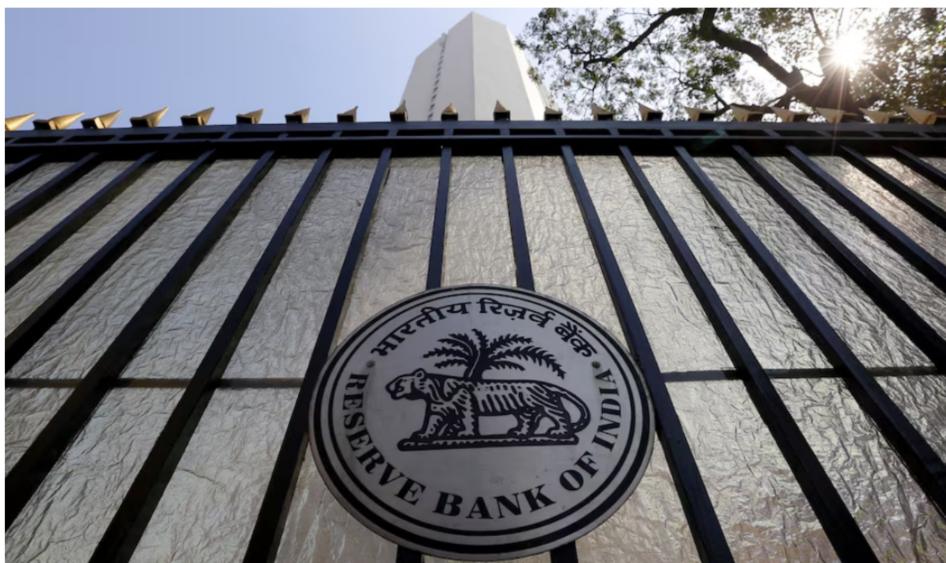
Reserve Bank of India

On 27 June 2024, the Reserve Bank of India (RBI) announced the revision in the Framework of Currency Swap Agreement for South Asian Association for Regional Cooperation (SAARC) countries for 2024-27. It will enable the Central Banks of SAARC member countries to come into bilateral swap agreements with RBI to avail the swap facility under the revised provisions.