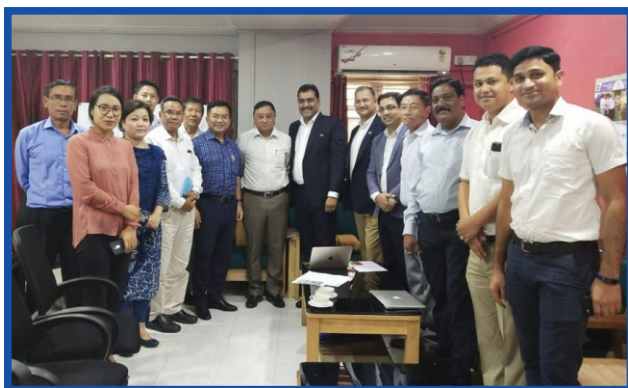
Kick-off meeting at Manipur

AG Group – AG Horizon Pvt Ltd is proudly providing consultancy to the Water Resource Project in the natural valley of Manipur. We are privileged to work with Water Resource Department of the Government of Manipur. Flood has been a perennial phenomenon in the natural valley of Manipur since the very inception of its existence. In the monsoon season, the region sees frequent floods and thus faces the loss of life, and infrastructure time and again. This is constantly hampering the economic development of underdeveloped states like Manipur. Our INR1000 Crores plus ambitious water resource project of the Manipur state government will primarily provide a master plan for prevention and mitigation of the issues related to floods and their impacts in the valley region.